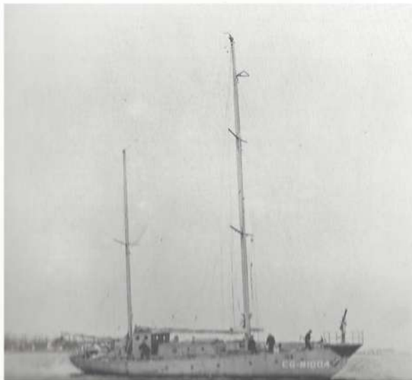
US Coast Guard 81004 (Tamaris) on her way out to ASW patrol. Her armament stands on clearly- a 50 cal water-cooled machine gun is mounted on her bow. and two sho depth-charge tracks are lifted on the stern.

ENGINE: Twin GM-6-71Ns, 165 hp diesel engines, completely rebuilt in 1995 SPEED: 10.5 knots at 1500 rpm TANKAGE: Fuel: 2000 gallons Water: 800 gallons ELECTRIC: 12v DC; 110/220v AC systems, Twin 20 kw Westerbeke diesel generators. Isolation transformer, DC breaker panel (new 1995). AC breaker panel (new 1995), (2) Consta-volt battery chargers, DC batteries replaced 1995. All wiring checked, repaired or replaced in 1995. New bilge. the generators have been replaced by 2 onan. LOCATION: SPAIN